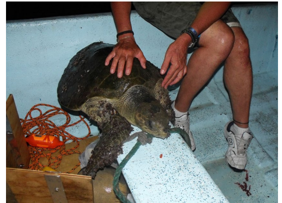
Research with the CastAway-CTD provided a foundation for better understanding of the dynamic ecosystem of Manzanillo's harbor, lagoon and coastal habitat.

SonTek, a Xylem brand 9940 Summers Ridge Rd. San Diego, CA 92121