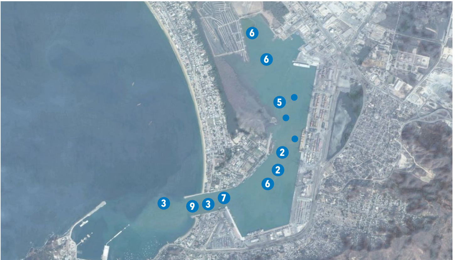
Gathering conductivity, temperature and depth data at multiple sites in Manzanillo harbor was easy with the one- pound CastAway-CTD. Results will guide the reconnection of the harbor with the freshwater lagoon to its north.